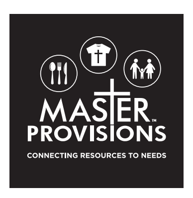
Single color icons on black