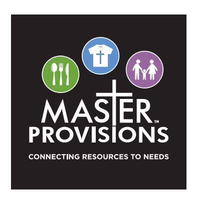
Full color icons on black